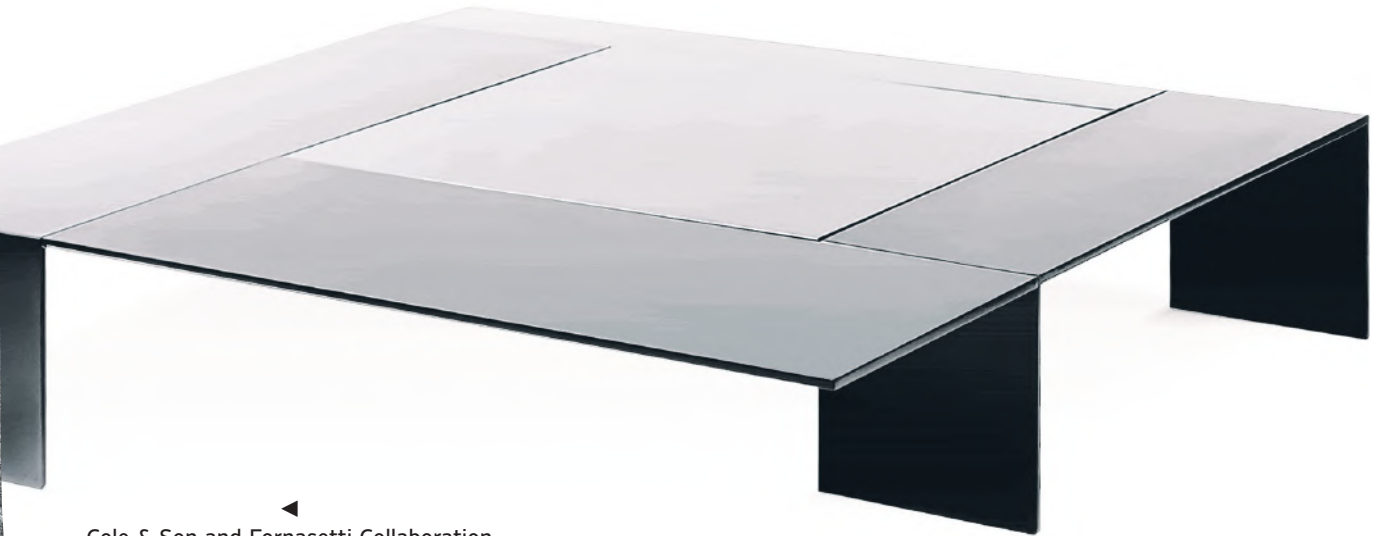
Mondo Coffee Table, from $3,036, okha.com